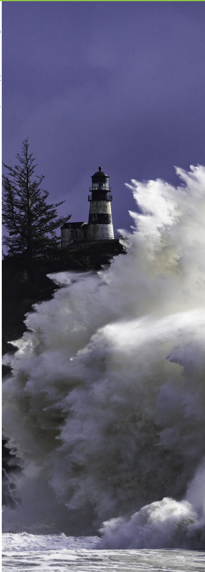
Cape Disappointment Lighthouse

Cape Disappointment is one of Washington's most popular state parks, and when you live on the peninsula, it's practically your backyard. Take in